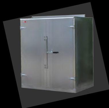
Modular 75 | Single Deep