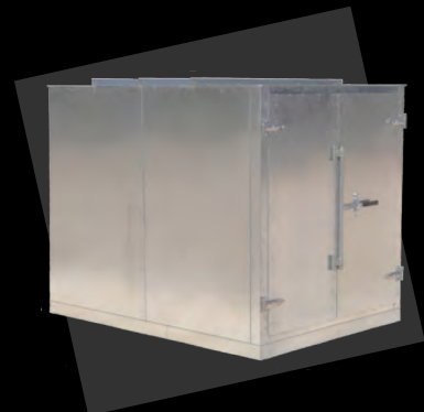
Modular 57 | Double Deep