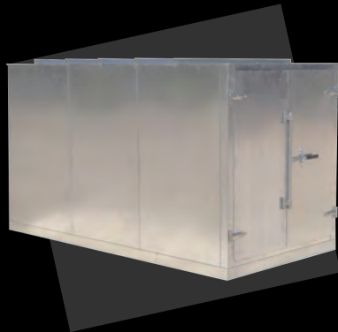
Modular 57 | Triple Deep