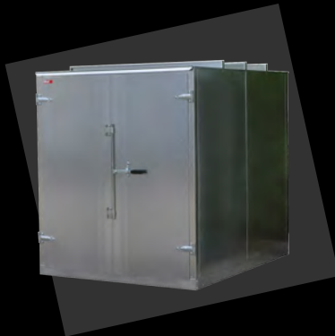
Modular 75 | Double Deep