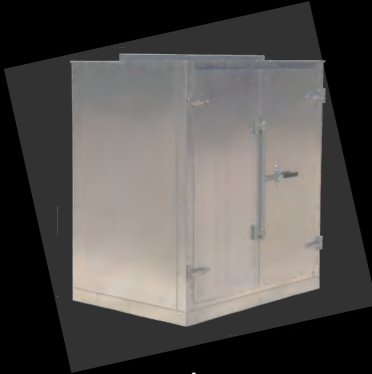
Modular 57 | Single Deep