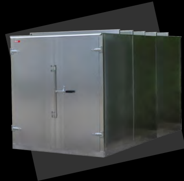
Modular 75 | Triple Deep